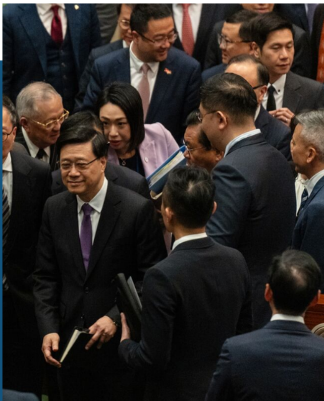
John Lee, center, following the passing of Article 23 at the Legislative Council in Hong Kong, on March 19.

On 19 March, Hong Kong lawmakers passed a new national security bill, Article 23. With an aim to safeguard the city against perceived threats, the law covers 39 offenses divided into five categories, including treason, sabotage, and external interference. The passage of the law has received support from Beijing and local business groups but has raised concerns among human rights advocates and critics who fear it could be used to suppress dissent and undermine fundamental rights.