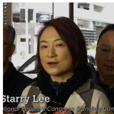
Starry Lee National People's Congress Standing Committee

Delegates from Hong Kong headed to Beijing for its annual two-sessions meetings, proposed raising the duty-free allowances and expanding multiple-entry visas for mainland visitors. These measures aim to enhance shopping convenience and boost tourism, reflecting efforts to strengthen economic ties and cultural exchange between mainland China and Hong Kong. The proposals underscore the significance of mainland visitors to Hong Kong's retail sector and the broader economy.