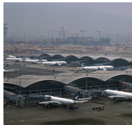
Lam Sai-hung. AFP, SING TAO

The Hong Kong government has expressed confidence that the three-runway system Hong Kong International Airport will commence by the end of the year. The system aims to handle 120 million passengers and 10 million tonnes of cargo annually by 2035. Additionally, supporting facilities, such as the reconfiguration of the centre runway and expansion of Terminal 2, are expected to be completed soon. The government will also set a goal for sustainable aviation fuel use based on global trends and supporting facilities in the city.